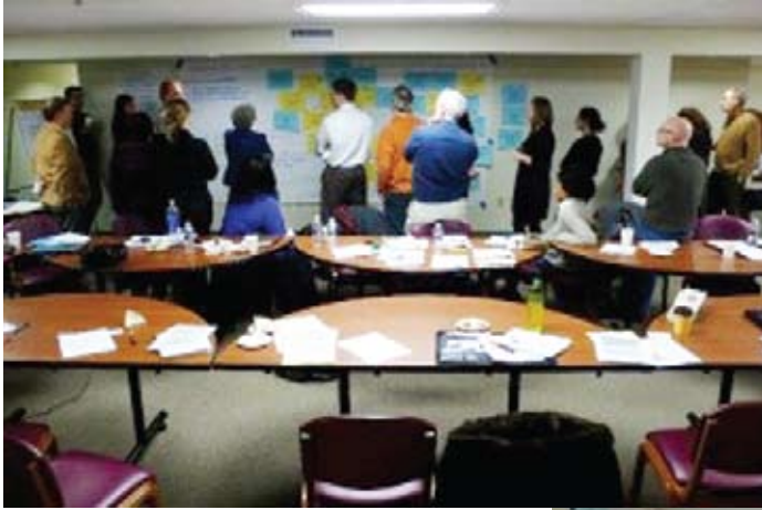
Kick-off meeting at the Resource Center for Independent Living for the Utica/Oneida Food Policy Council